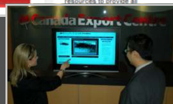
Displayed in nine International Offices Around the Globe!